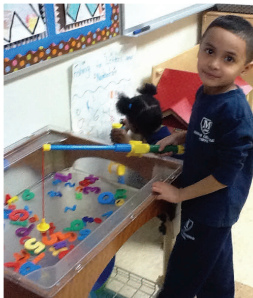
Fishing for letters and numbers!