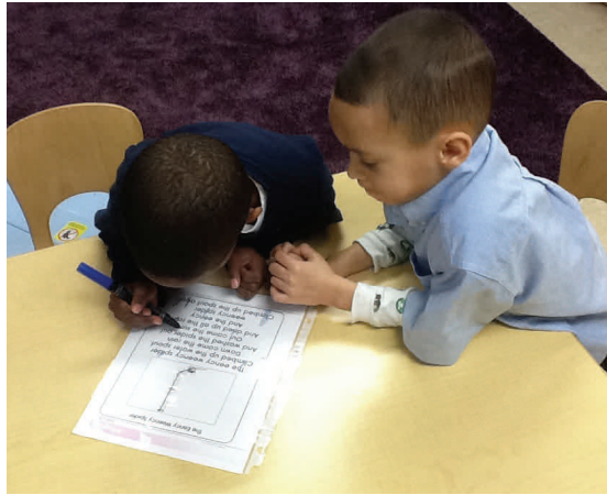
Hard at work searching for letters!

This has been a very productive week in K1! We have been spending a lot of time talking about what a map is, what our favorite colors are and what people and places make up a community. Take a look at some of our brainstorms next time you are in our classroom as K1 scholars have generated some wonderful thoughts and ideas!