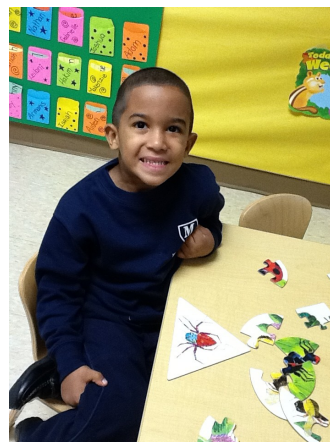
Scholars showing great teamwork during Art!