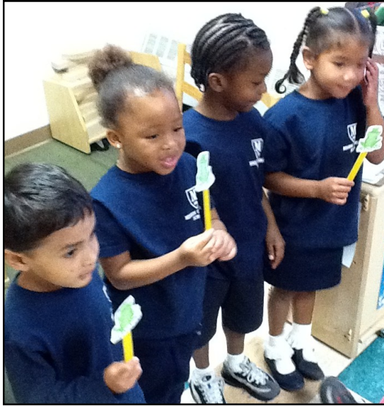
Sing and acting out one of our favorite songs: "Five Green and Speckled Frogs!"